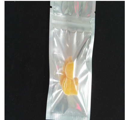
SERVING MASS (g): 2.66 SERVINGS/UNIT: 1